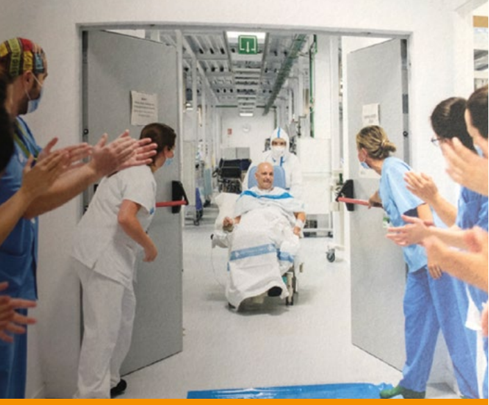
Despite defeating COVID and leaving the ICU, a patient's greatly reduced muscle mass means many weeks of rehabilitation and use of a wheelchair.

Dysgeusia/ageusia/anosmia is present in about 80% of patients experiencing early COVID-19 variants, and less frequently in those with the delta variant, one of the worst mutations in terms of infectibility and aggressiveness. These symptoms also influence nutritional behaviour, as a lack of smell and taste decreases appetite. In survivors over 70 years of age, non-recovery to normal gustative and olfactive function may contribute to anorexia associated with ageing and, thus, further impair nutritional status. The causative mechanisms were initially oro-naso-pharyngeal lesions directly related to the coronavirus, but consistent information now indicates that central involvement related to microhaemorrhages plays a major role. Recovery may take months in a substantial number of people, being more rapid in young individuals.