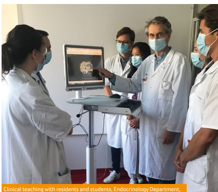
nical teaching with residents and students, Endocrinology Department chin Hospital, Paris, France.

Medical school was a very late pick. My original dilemma was between cinema, agronomy, and political science. These may seem very diverse, but the approach was similar for me: first observe to understand, and then be able to provide something to help others. The choice of medical school was mostly based on the idea that I could always change back to the