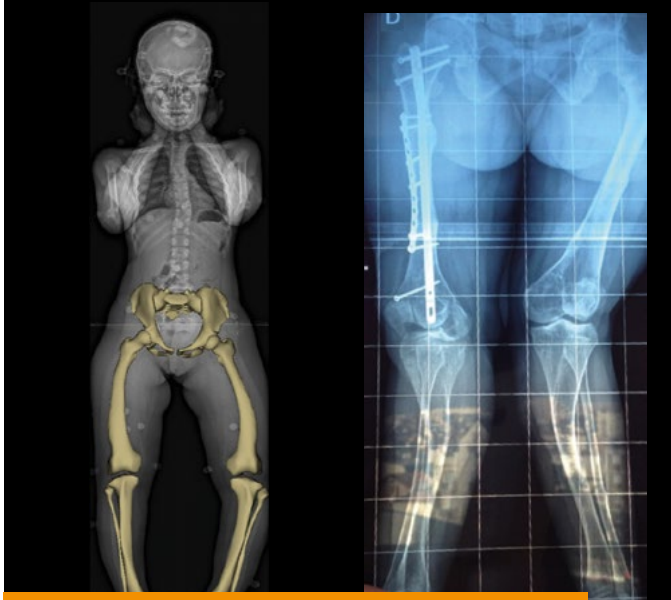
Skeletal consequences of increased FGF23 levels in XLH in a child (left) and a young adult who was not treated during childhood (right).

The discovery of FGF23 in the early 2000s, along with the proof of concept in Hyp mice that antibodies against FGF23 rescue phosphate reabsorption through the kidney, endogenous 1,25(OH)<sub>2</sub>D synthesis and rickets, led to the development of new therapeutic avenues targeting the FGF23 pathway.<sup>1</sup> Clinical trials and reports have shown that use of anti-FGF23 antibodies (named burosumab) allows near normalisation of serum phosphate and phosphate renal tubular reabsorption, significant improvement in the endogenous synthesis of 1,25(OH)<sub>2</sub>D and improvement of rickets in all affected children with XLH. Surprisingly, growth velocity is only minimally improved. This therapeutic effect is sustained over more than 3 years, associated with a satisfactory safety profile.