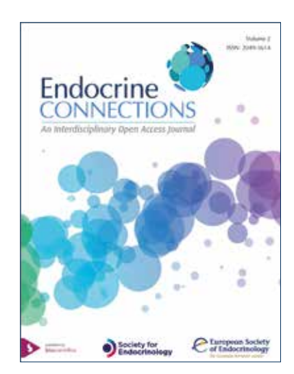
To submit your article to Endocrine Connections, visit www.endocrineconnections.com.

Consequently, all articles published in Endocrine Connections will now be freely available in PubMed Central, increasing the reach and discoverability of authors' work. This is a major achievement in the establishment of a new journal, and a crucial consideration for authors when deciding where to publish their work.