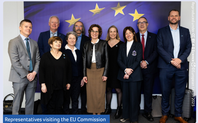
Representatives visiting the EU Commission

ESE and Endocrine Society experts met EU policymakers to discuss EDCs and human health, biodiversity and the environment.