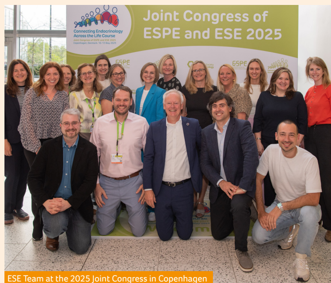
ESE Team at the 2025 Joint Congress in Copenhagen